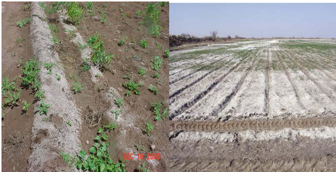
Figure 3. Schematic picture of adverse effects Soil salinity on soil structure. Photo was taken from irrigated lands in the Wabi Shebelle River basin, Ethiopia, indicating the presence of high soil salinity.

Salinity problems are most extensive in the irrigated arid and semi - arid regions (Pal and Mondal, 1980; Flávio et al. , 2008). In every river basin prior to the introduction of irrigation there existed a water balance between rainfalls on the one hand and stream flow, groundwater level and evaporation and transpiration on the other. This balance is disturbed when large additional quantities are artificially spread on the land for agriculture. Moreover, evaporation of groundwater through the soil surface will raise the salinity of the soil surface and root zone. Such salinization problems can be more severe when the salinity of the groundwater is high, as is usually the case in arid regions. Once the water table is within 1 to 2 m of the soil surface, saline groundwater can contribute significantly to evaporation from the soil surface and, thereby, to root zone salinization (El-Gabaly, 1971). Localized redistribution of salts can often cause salinity problems of a significant magnitude. Soluble salts move from areas of higher to lower elevations, from relatively wet to dry areas, and from irrigated fields to the adjacent non - irrigated fields, etc.