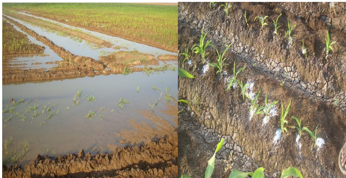
Figure 2. Schematic picture of adverse effects of over irrigation on soil structure and Maize crop production. Photo was taken from irrigated lands in the Wabi Shebele River basin, Ethiopia, indicating the presence of high salinity irrigation.