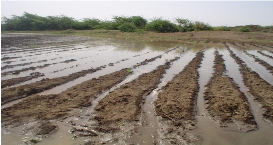
Figure 1. Schematic picture of adverse effects of waterlogged on soil structure. Photo was taken from irrigated lands in the Wabi Shebele River basin, Ethiopia, indicating the presence of high poor irrigation.