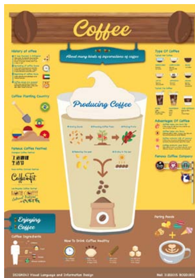
Figure 1. Coffee information visualization design.

Memory function pays attention to the effect of users receiving information, and people's memory in a period of time, including memory capacity, time pressure and accuracy (Du Hemin & Jiang Junjie, 2022). In the visual design, the image is the main expression content, and the public can easily remember the image, so the influence should be mainly based on the image, and less words should be used to improve the accuracy of the user's memory. For example, in the information visualization design of coffee (Figure 1), coffee graphics are mainly used. Different types of coffee are only introduced in one word, and the rest are introduced in graphics, so that the audience can receive information at the first time.